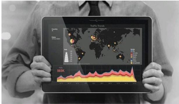
Tableau lets you see and understand data, reports and dashboards faster through its unique, easy-to-use visual analytics technology.

Come join us to see how you can extend the power of Tableau's data visualization with predictive analytics using open-source R.